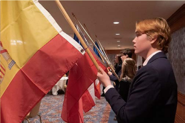
After 2 years of not meeting, the No 1. good feeling of everyone was meeting in person again.