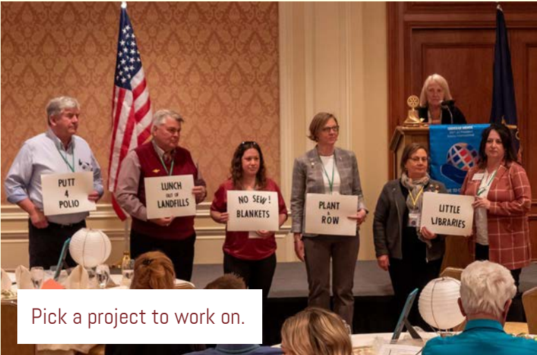
Pick a project to work on.