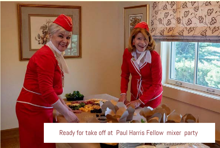
Ready for take off at Paul Harris Fellow mixer party